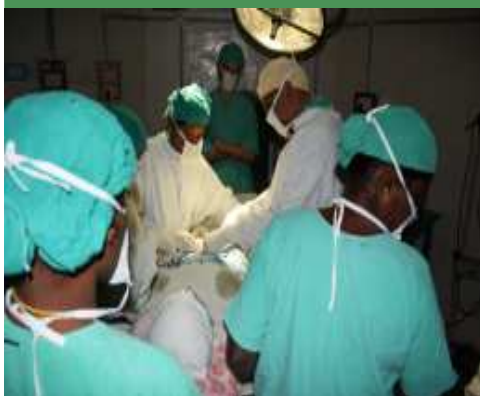
Surgery in present OT