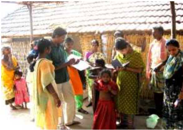
Survey work in the Kalrayan Hills

After some delay the new Project in the Kalrayan Hills got off to a flying start. This was also due to stable funding from BCF [Business & Community Foundation]. Initial scouting and selection of 30 villages were done. All the villages are part of Villipuram district and most have no bus connections, with tribals often having to walk 10 – 15 km to just get to the bus stop. Health conditions are deplorable, with none of the regular health programs reaching them. We have finished an initial survey of