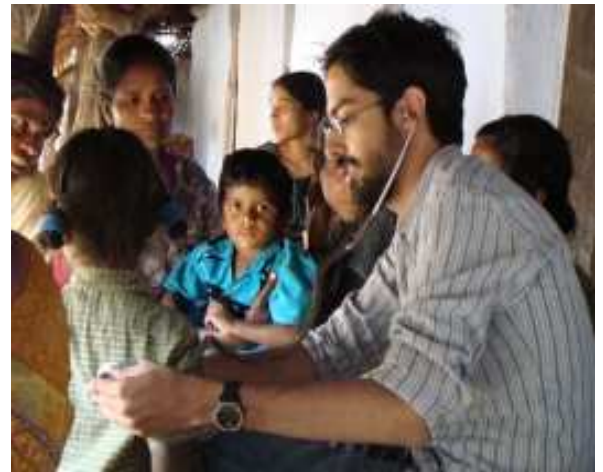
Effective community health has reduced infant mortality

The new Out Patient block is of great use for the increasing number of patients. Due to many new projects being taken up, we have had to cut down on our inpatient work including surgeries. One disturbing trend was the increasing number of HIV cases being detected after the start of the new ICTC. More active work is planned on this