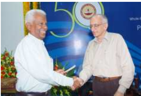
IIT Chennai donates for the Technology Initiative

After many road blocks, NCRI [National Council for Rural Institutes] has agreed to support our efforts to train the tribals in trades that will help them to seek out a better livelihood. IIT , Chennai and many other friends are helping us to make the initial training sheds which will be completed soon.