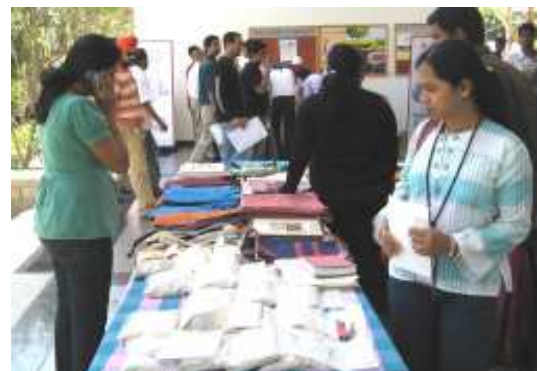
Porgai exhibition in Infosys